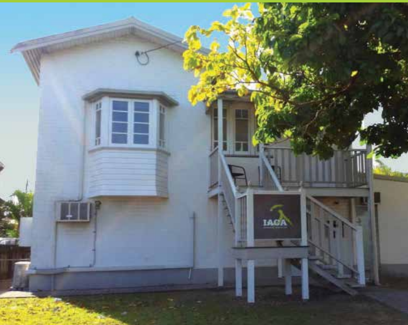
IACA Office, Scott St. Parramatta Park.