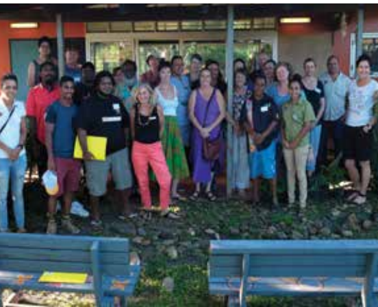
IACA members at Hopevale Arts and Culture Centre 2015.