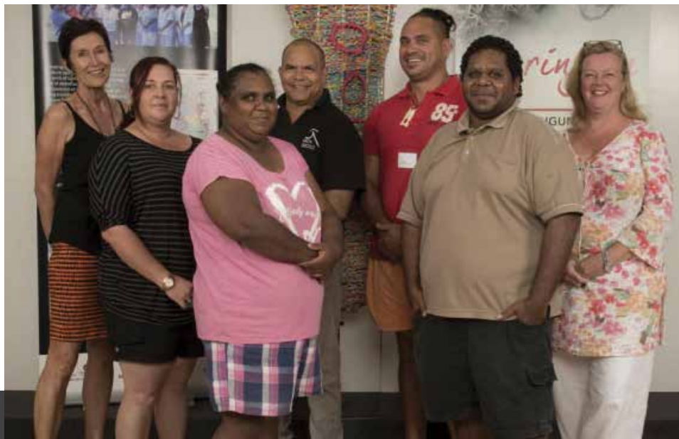
IACA Management Committee 2014.

The IACA Management Committee met five times during the 2014/15 year.