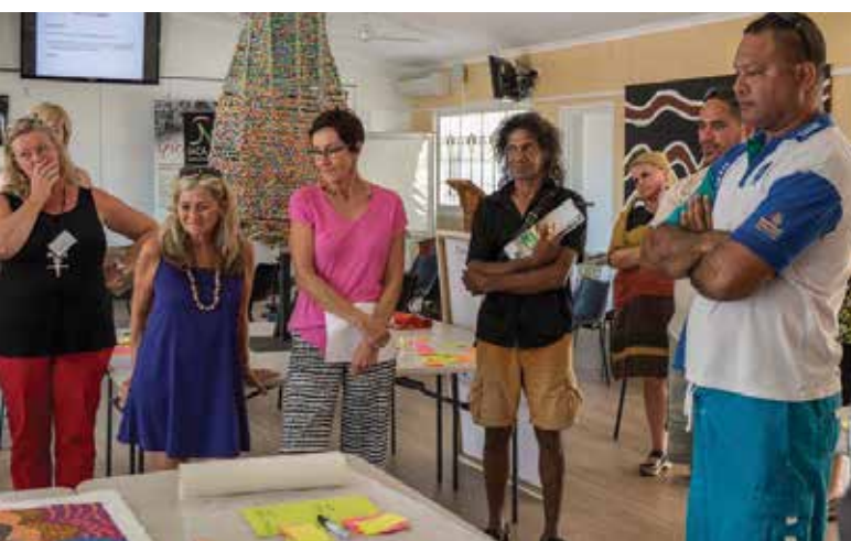
The Price is Right workshop at Cardwell Conference.

Following a warm Welcome to Country by Traditional Owner and Girringun Corporation Chair